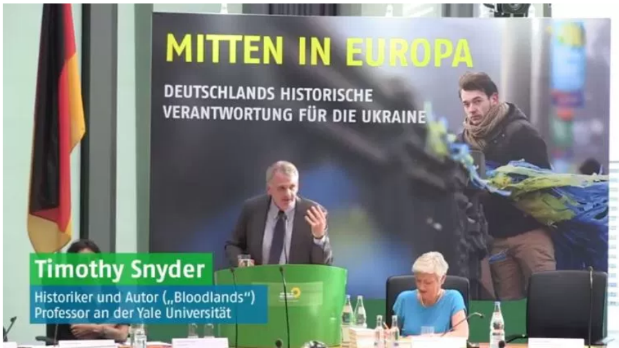
Screenshot from the video